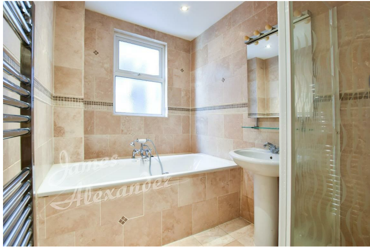
Bathroom 9'2" x 5'10" (2.80 x 1.80)