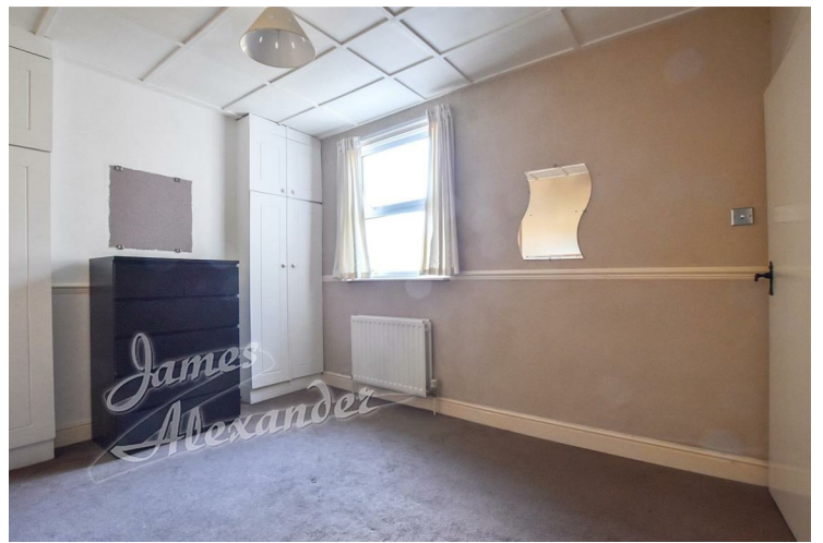
Bedroom 2 11'5" x 10'2" (3.50 x 3.10)