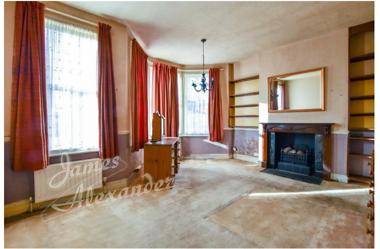
Bedroom 1 15'8" x 15'1" (4.80 x 4.60)