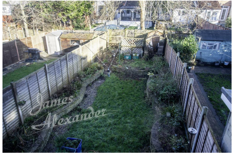
Garden additional view