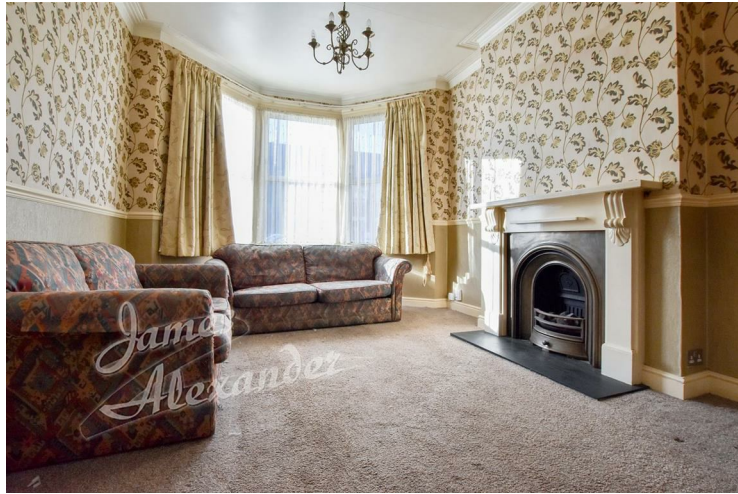
Reception 31'5" x 12'5" (9.60 x 3.80)