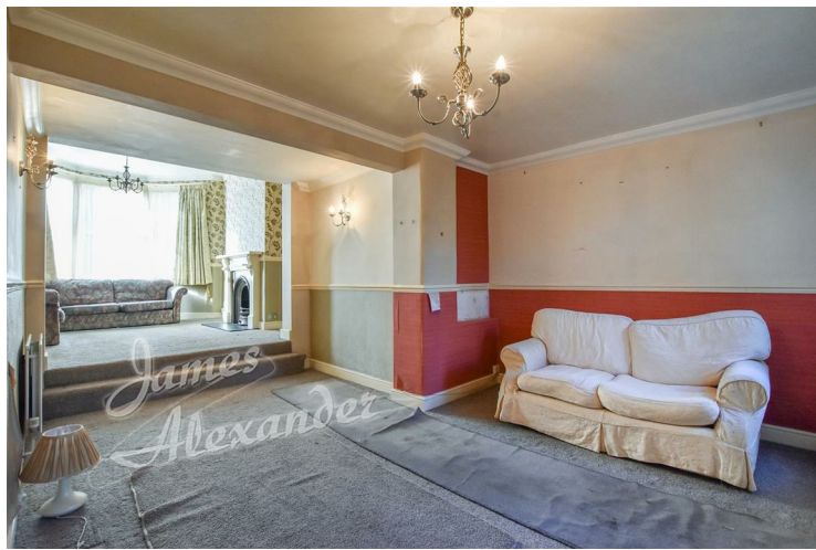
Reception additional view